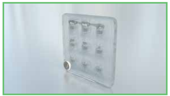
AIRLIGHT™ SKYLIGHT INSULATOR

USE REFLECTIX TO INSULATE YOUR WINDOWS. REFLECTIX IS ALSO USEFUL TO PLACE IN SMALL AREAS WITH DRAFTS OR IN WHEEL WELLS ON CLASS A/B/C MOTORHOMES.