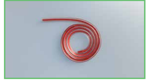
SHARP EDGE TAPE PROTECTOR FOR USE ON SHARP OR LONG EDGES THAT AREN'T 90 DEGREES. AN ADHESIVE BACKING IS PRE-APPLIED.