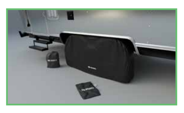
DUAL-AXLE TIRE COVERS

OUR DUAL-AXLE TIRE COVERS PREVENT AIR FROM ESCAPING FROM BETWEEN YOUR TIRES AND ALSO COVER YOUR TIRES TO KEEP THEM CLEAN AND OUT OF THE SUN.