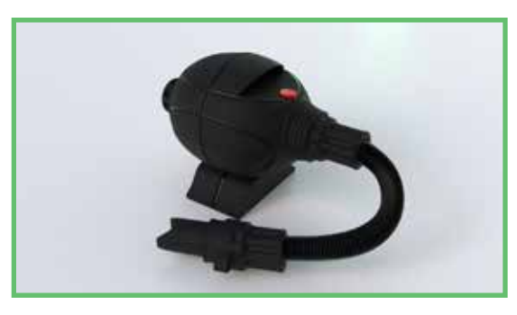
ELECTRIC AIR PUMP, AC 800W INFLATES AND DEFLATES YOUR SKIRT. CONNECT HOSE TO THE PORT CLOSEST TO THE ON/OFF SWITCH TO INFLATE. REVERSE SIDES TO DEFLATE.