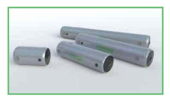
SKIRT TUBES, VARIOUS SIZES SKIRT TUBES ARE THE BASIS OF THE AIRSKIRTS SYSTEM AND RUN AROUND THE PERIMETER OF YOUR RV.