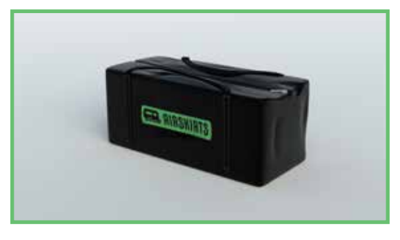
AIRSKIRTS STORAGE BAG OUR STORAGE BAG HOLDS YOUR KIT WHILE IN STORAGE OR TRANSIT. LARGER KITS COME WITH TWO STORAGE BAGS.